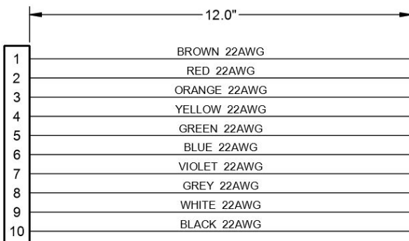
CON-16404280 0.156" CENTERS