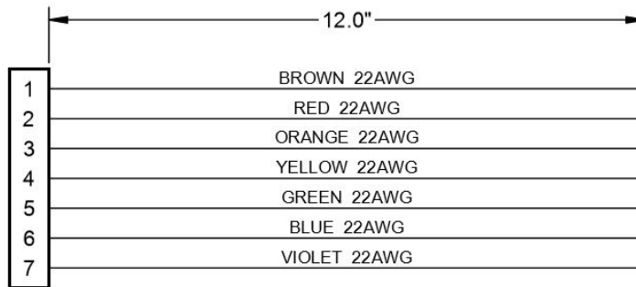
CON-6404287 0.156" CENTERS